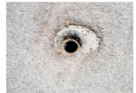
Missing cleanout cover