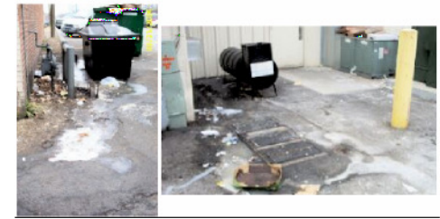
Stormwater impact from recycle bin spill