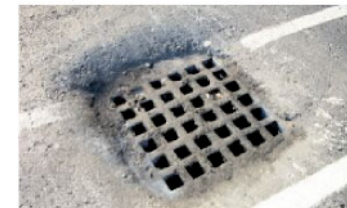
Grease evidence at storm gate. Grease was discharged into stream Enforcement action was taken.