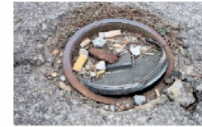
Damaged cleanout cover

Sewer Cleanouts: Regularly check all sewer cleanouts on your facility's property to make sure the covers are solid and secure. Replace damaged or missing cleanout covers immediately to prevent rainwater inflow and problems.