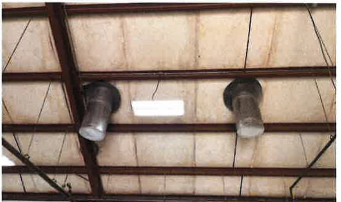
Sewer Complex Garage Roof Leaks