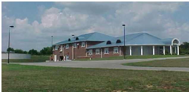
HWEA's Moss Water Treatment Plant

On average HWEA produces an average of 6.79 million gallons per day of drinking water for the City of Hopkinsville and Christian County. The peak demand for water was 10.16 million gallons per day.